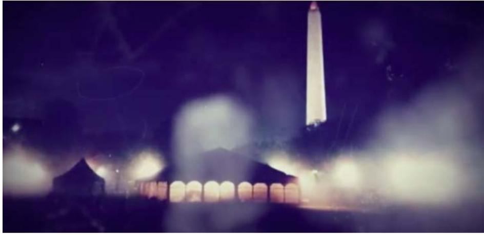
The fight to sustain David's Tent

As those in Christ, we are not merely survivors , but we are victorious! Yet at times it sure seems that the greatest victory is simply surviving. "...and after you have done everything -- to stand" Ephesians 6:13